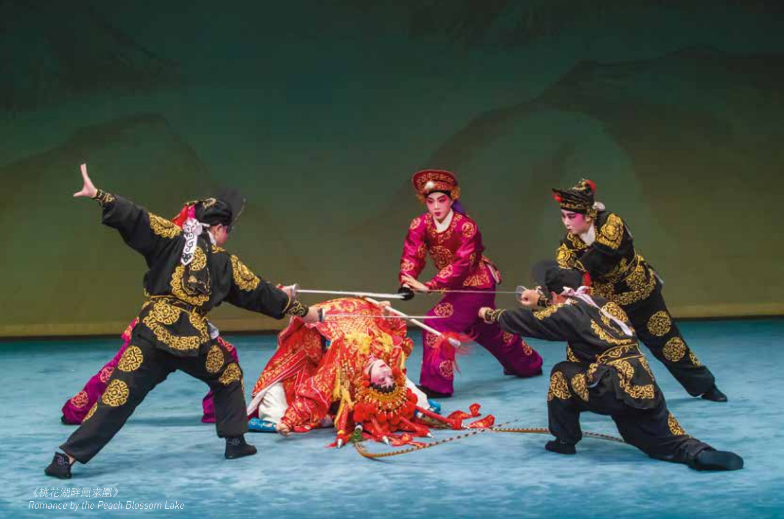
《桃花湖畔鳳求凰》 Romance by the Peach Blossom Lake