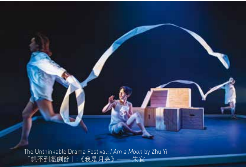
The Unthinkable Drama Festival: I Am a Moon by Zhu Yi 「想不到戲劇節」：《我是月亮》——朱宜