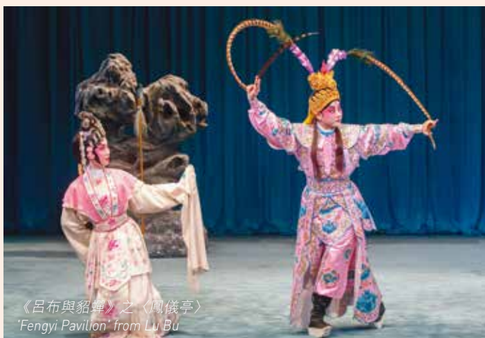
《呂布與貂蟬》之〈鳳儀亭〉 "Fengyi Pavilion" from Lu Bu