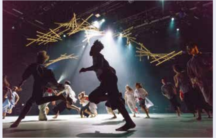
Three Fingers at Arm's Length by Leila McMillan 麥麗娜《Three Fingers at Arm's Length》