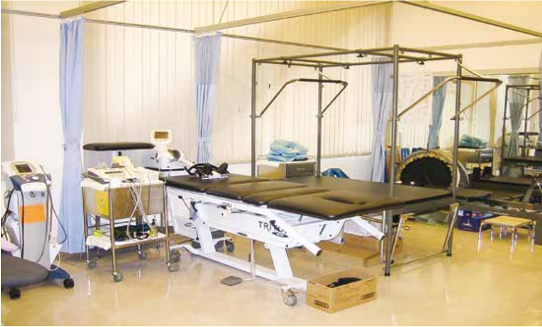
The Physiotherapy Clinic 物理治療診所