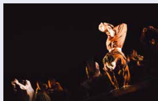
Coven by Mickael 'Marso' Riviere 江華峰《聚》