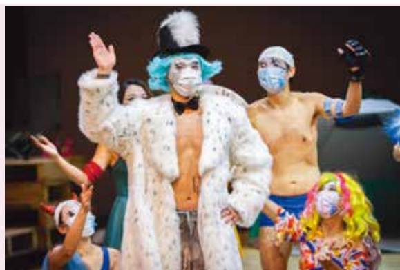
《海灘上的安蒂岡妮》 Antigone on the Beach

Drama is at the very heart of human expression, its communication and identity. The School of Drama believes that its unique position in Asia offers an insight into this artform that will both inform and develop significant creativity and distinctive artists to engage with and feed the cultural community of Hong Kong, the Mainland and beyond. The School of Drama strives to be an incubator, catalyst and repository of the values and importance of the dramatic and performative arts and expresses this in the nurturing of actors, directors, playwrights, dramaturgs and teachers who will function as practitioner-artists making a tangible difference to their community and their chosen discipline.