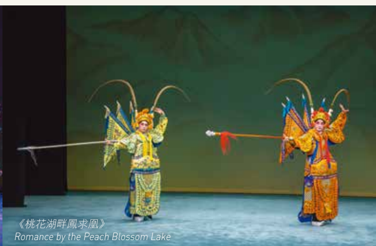
《桃花湖畔鳳求凰》 Romance by the Peach Blossom Lake