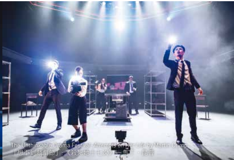
The Unthinkable Drama Festival: Attempts on Her Life by Martin Crimp 「想不到戲劇節」：《殺死她十七次》——馬丁·昆普