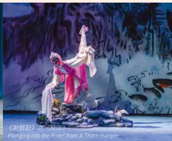
《荊釵記》之〈投江〉 "Plunging into the River" from A Thorn Hairpin