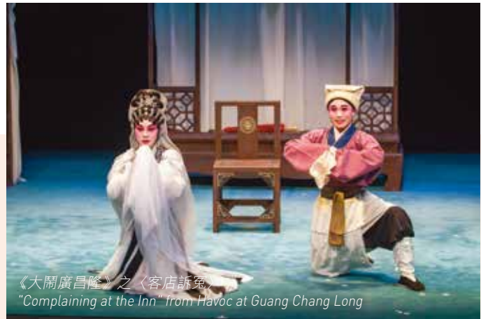
《大鬧廣昌隆》之《客店訴冤》 "Complaining at the Inn" from Havoc at Guang Chang Long

學士課程提供粵劇表演和粵劇音樂兩項專修，旨在發展學生之學術及智能達至資歷架構第五級及專業水平之戲曲表演技巧。課程亦重視發展學生之藝術創意和獨立性和對戲曲與其他學科和藝術相互關係之認識，以鼓勵學生擴展知識層面。學生學習戲曲之審美及發掘傳統創作過程之新應用。課程的畢業生將會是有效推動戲曲藝術的專門人才。