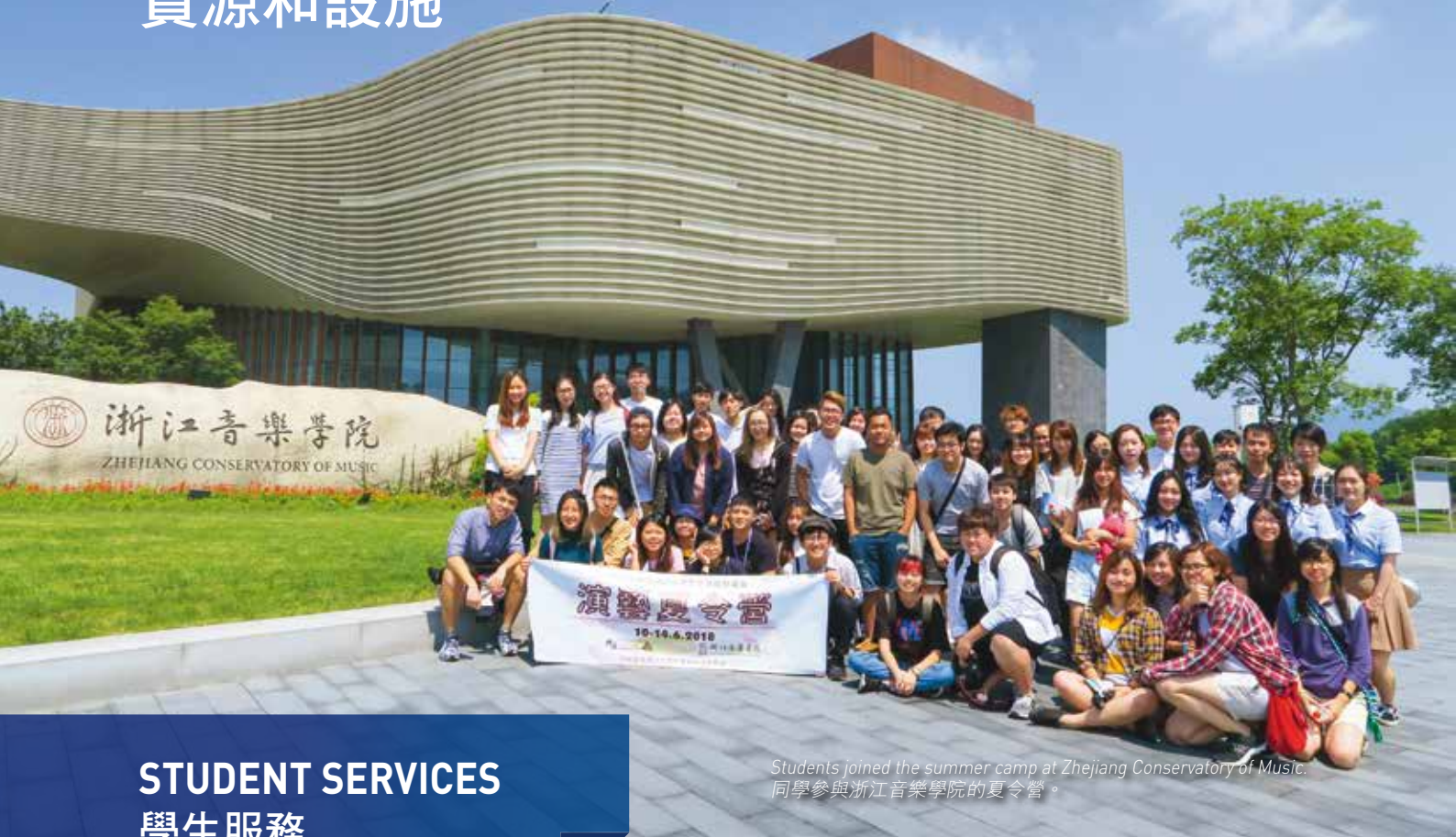
Students joined the summer camp at Zhejiang Conservatory of Music. 同學參與浙江音樂學院的夏令營。