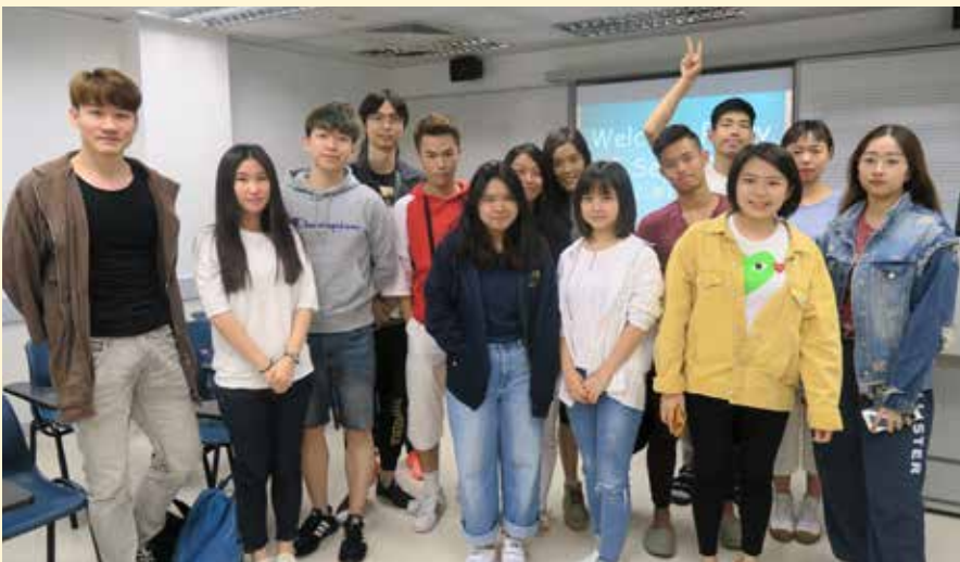
Gatherings for newly arrived non-local students and their buddy mentors 非本地新生及師友參與活動