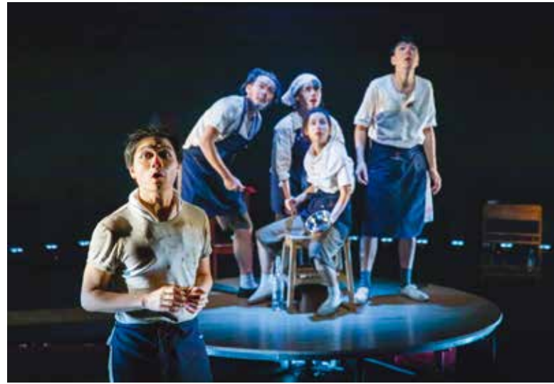
The Unthinkable Drama Festival: Der goldene Drache by Roland Schimmelpfennig 「想不到戲劇節」：《金龍》—— 羅蘭·希梅芬尼

戲劇畢業生的工作機會十分專業化和多樣化，部分畢業生加入本地戲劇團體或電視台，如香港話劇團、中英劇團、無綫電視、有線電視及 ViuTV 等。有些以自由工作者形式參與電影、電視和新媒體創作，或創立自己的新劇團。有部分學生則參與和表演藝術有關的教學及行政工作等。