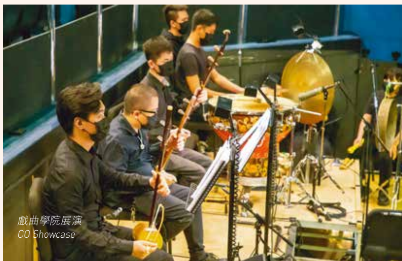
戲曲學院展演 CO Showcase

學員畢業後可受僱於香港不同的粵劇團體，亦可自組粵劇團或以自由工作者身分擔任演員、伴奏樂師、粵劇/粵曲導師、編劇、評論、研究員或參與不同的創意專業。政府會堂及文娛中心亦常聘用對粵劇有認識的行政及管理人員。畢業生亦可從事粵劇教育及推廣工作。