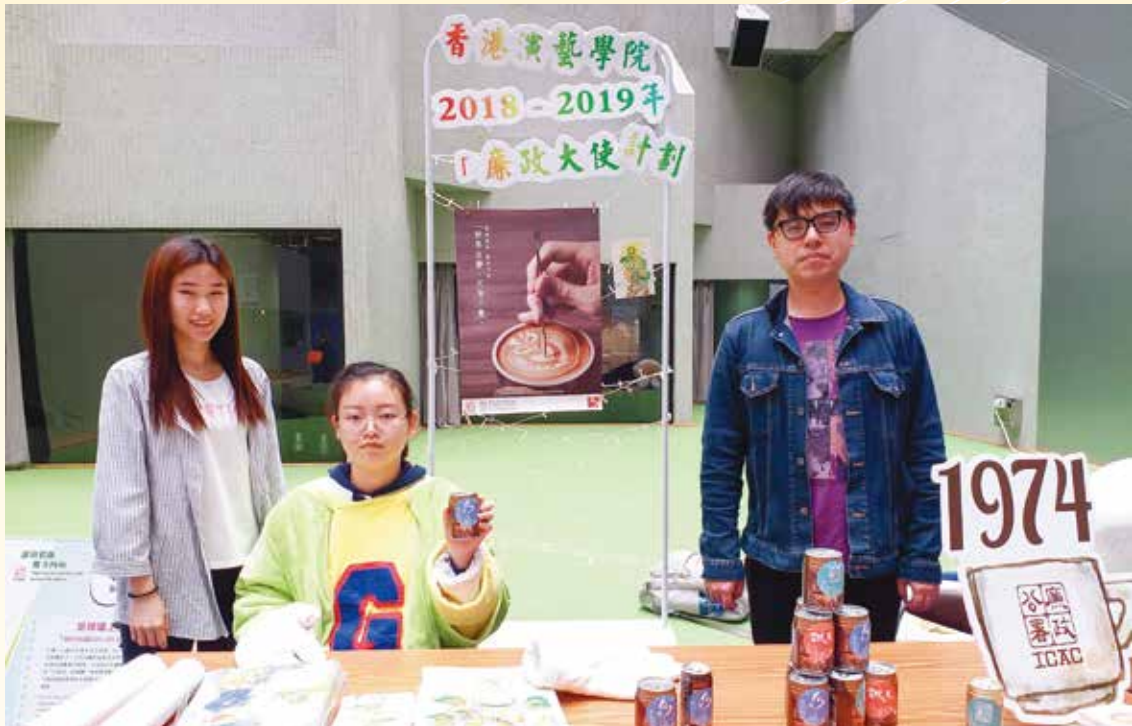
Roadshow of ICAC Ambassadors to promote the importance of campus integrity. 廉潔大使宣揚校園廉潔文化的訊息。

職業指導服務會協助學生探討個人職業取向，以計劃畢業後的事業發展。學院亦會提供撰寫求職信及履歷及面試技巧等職前培訓予準畢業生。