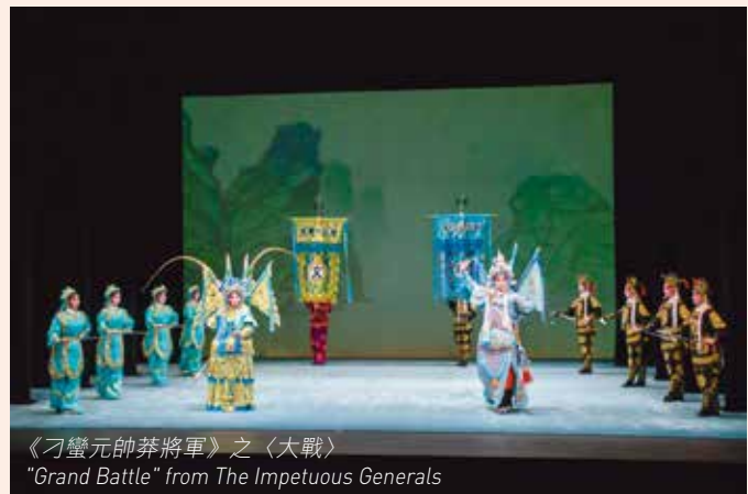
《刁蠻元帥莽將軍》之《大戰》 "Grand Battle" from The Impetuous Generals